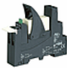
PI85 with socket GZT80