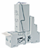
T-R4 with socket GZM4