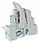
PIR4 with socket GZM4