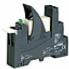
PI84 with socket GZT80