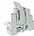
PIR3 with socket GZM3