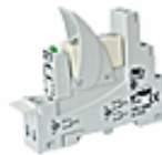
PI85 with socket GZM80